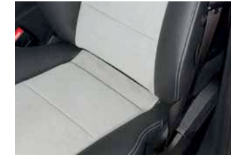
Car seats (Alcantara)