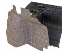
Insulating materials for cars