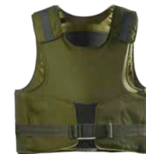
Protective clothing (Kevlar)