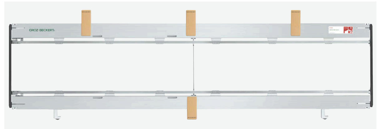
ALrefix-P heald frame