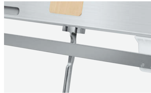
ALrefix-P intermediate support