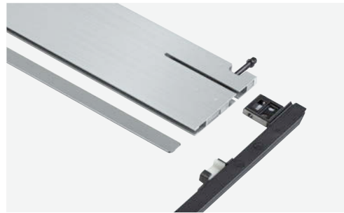
ALrefix-P corner connection