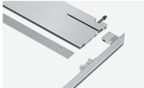
ALrefix FERvari corner connection