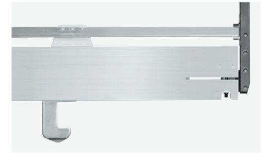
ALrefix-P driving hook