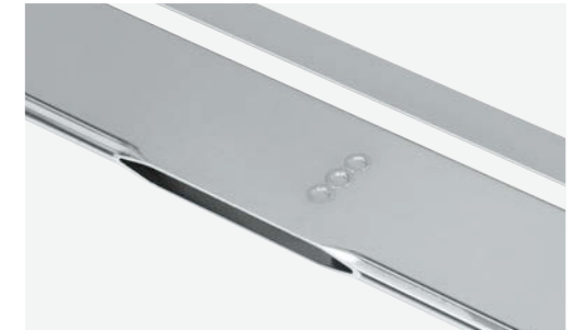
ALrefix FERvari driving position slot