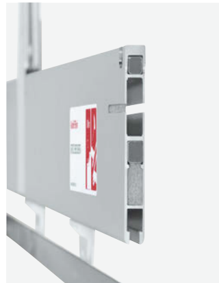
ALrefix FERvari profile