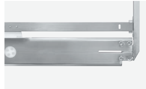
ALrefix FERvari corner connection