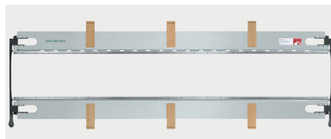
ALtop155 heald frame