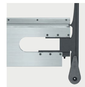
ALtop155 driving connector link