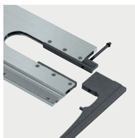
ALtop155 corner connection