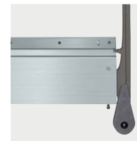
ALfix-U driving connector link