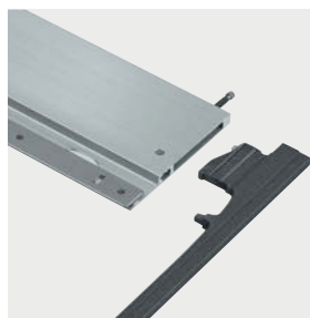
ALfix-U corner connection