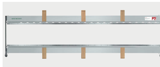
ALfix-U heald frame