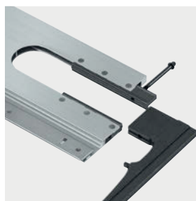
ALtop140 corner connection