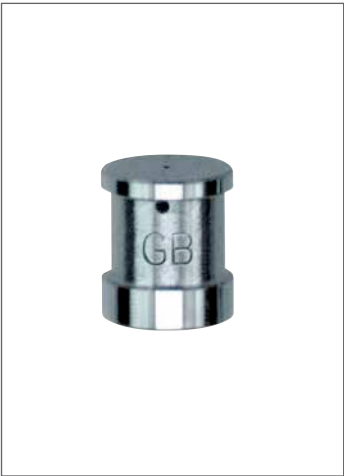
High-precision internal and external machining