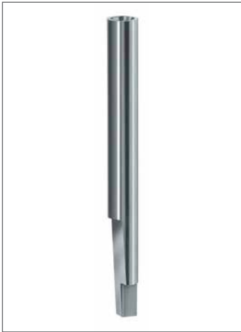
Guide bush with cutting surface