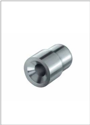
Polished radii and chamfers