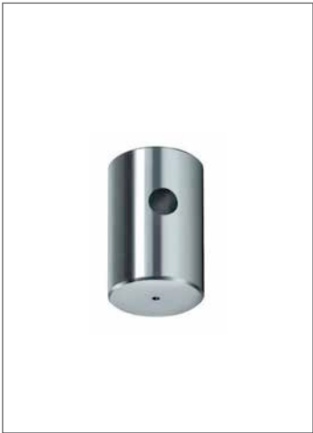
Mixing nozzle with two channels