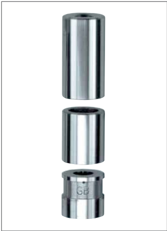
High-precision guide systems