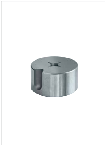
Special shapes to meet customer requirements