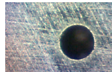
HyTec® P jet strips