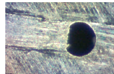
Conventional jet strips