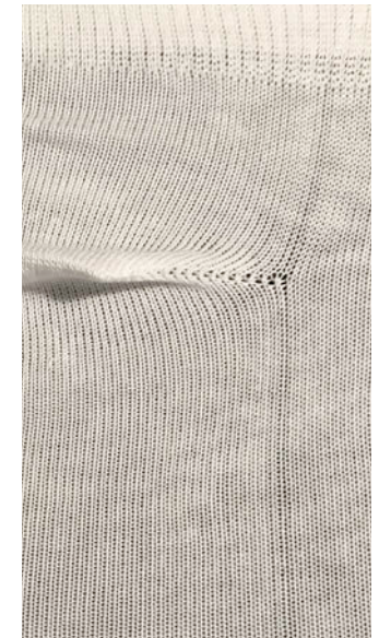
Needle lines caused by a stiff latch

dur™ needles can help to reduce different kinds of knitting faults.