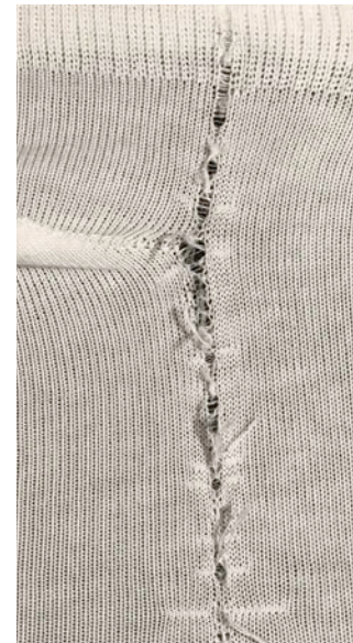
Knitting error caused by a broken needle