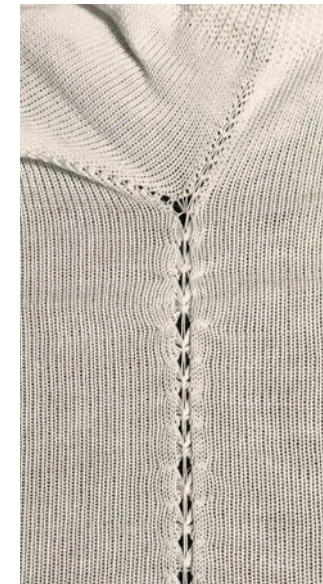
Tuck stitches caused by a bent needle latch