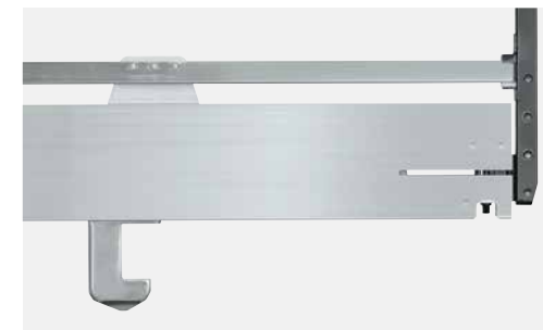
ALrefix-P driving hook