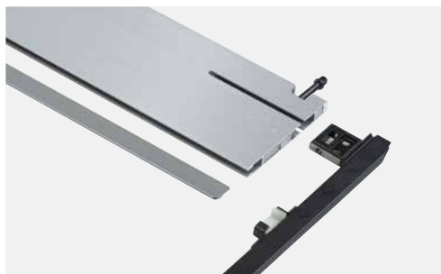
ALrefix-P corner connection