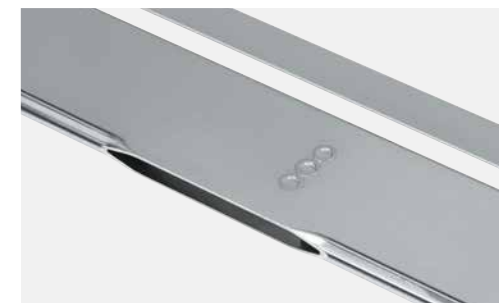
ALrefix FERvari driving position slot