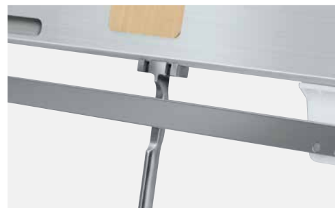
ALrefix-P intermediate support