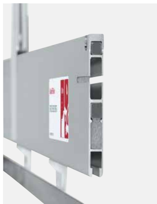
ALrefix FERvari profile