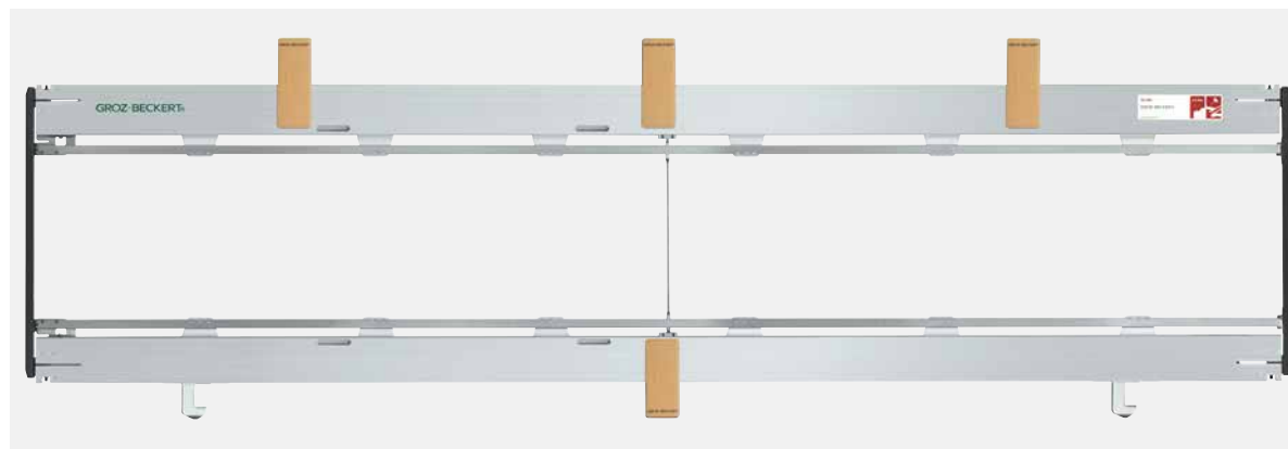
ALrefix-P heald frame