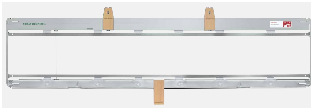
ALrefix FERvari heald frame