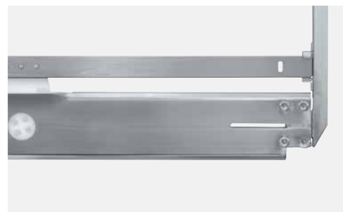
ALrefix FERvari corner connection