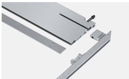
ALrefix FERvari corner connection