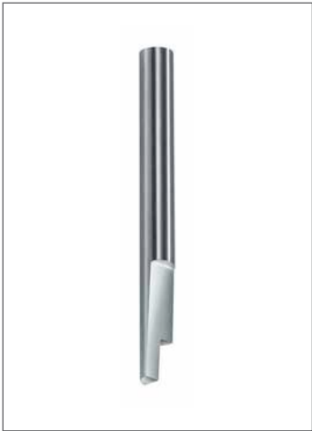
Special external shapes