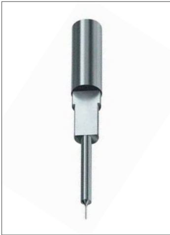
Aligning surfaces for molded parts