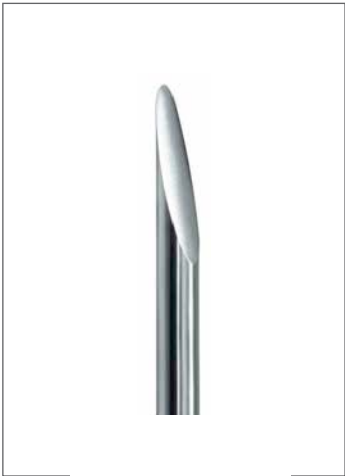
Edge rounding and finish quality