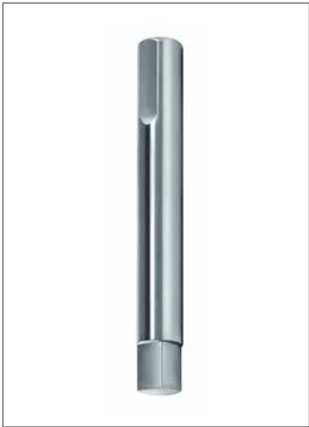
High shape and position accuracy