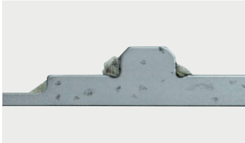
Full shank needle