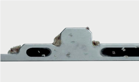
Steel composite high performance needle

Comparison of the steel composite needle to the low-maintenance full shank needle and the high performance meander low profile needle: