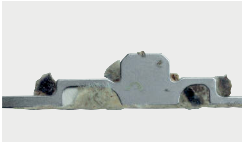
Meander low profile needle

Used in state-of-the-art high performance machines.