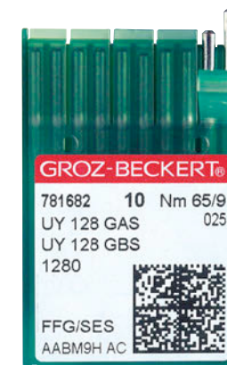
Groz-Beckert needles with DataMatrix code